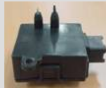
Cluster Ion Generator with plus & minus electrodes

Specifications and descriptions contained in this document were in effect at the time of publication. Visteon reserves the right to discontinue any equipment or change specifications without notice and without incurring obligation.